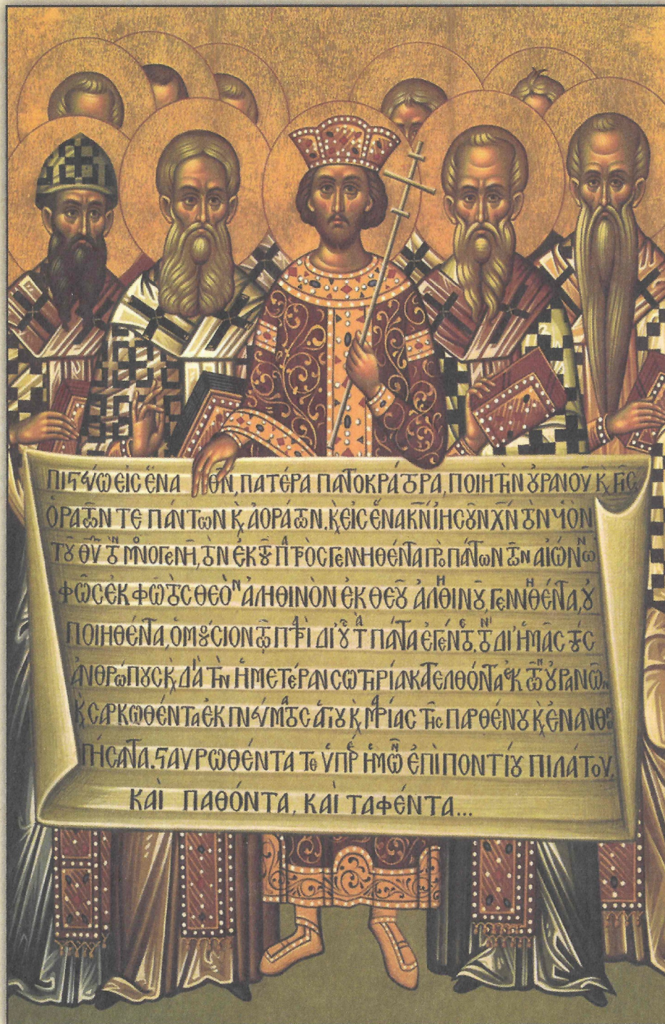
Icon of the Fathers of the First Ecumenical Council of Nicea